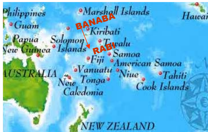
The Banabans were removed from Banaba and sent to Rabi Island in Fiji over 2,000 miles away

In 1965 Banabans began legal proceedings against the Colonial government in the British High Court. This expensive and long fought legal battle would end up becoming one of the